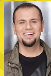
Mo Amer Pioneer of Arab-American Stand Up

SATURDAY APRIL 18, 2015 SILVER SPRING SHERATON HOTEL