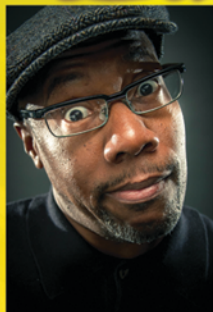
The Critically Acclaimed Preacher Moss